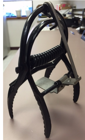
Set trap with safety on