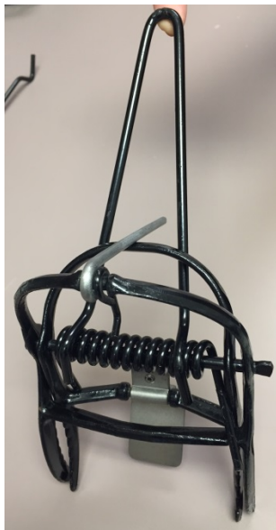
One tong on spring